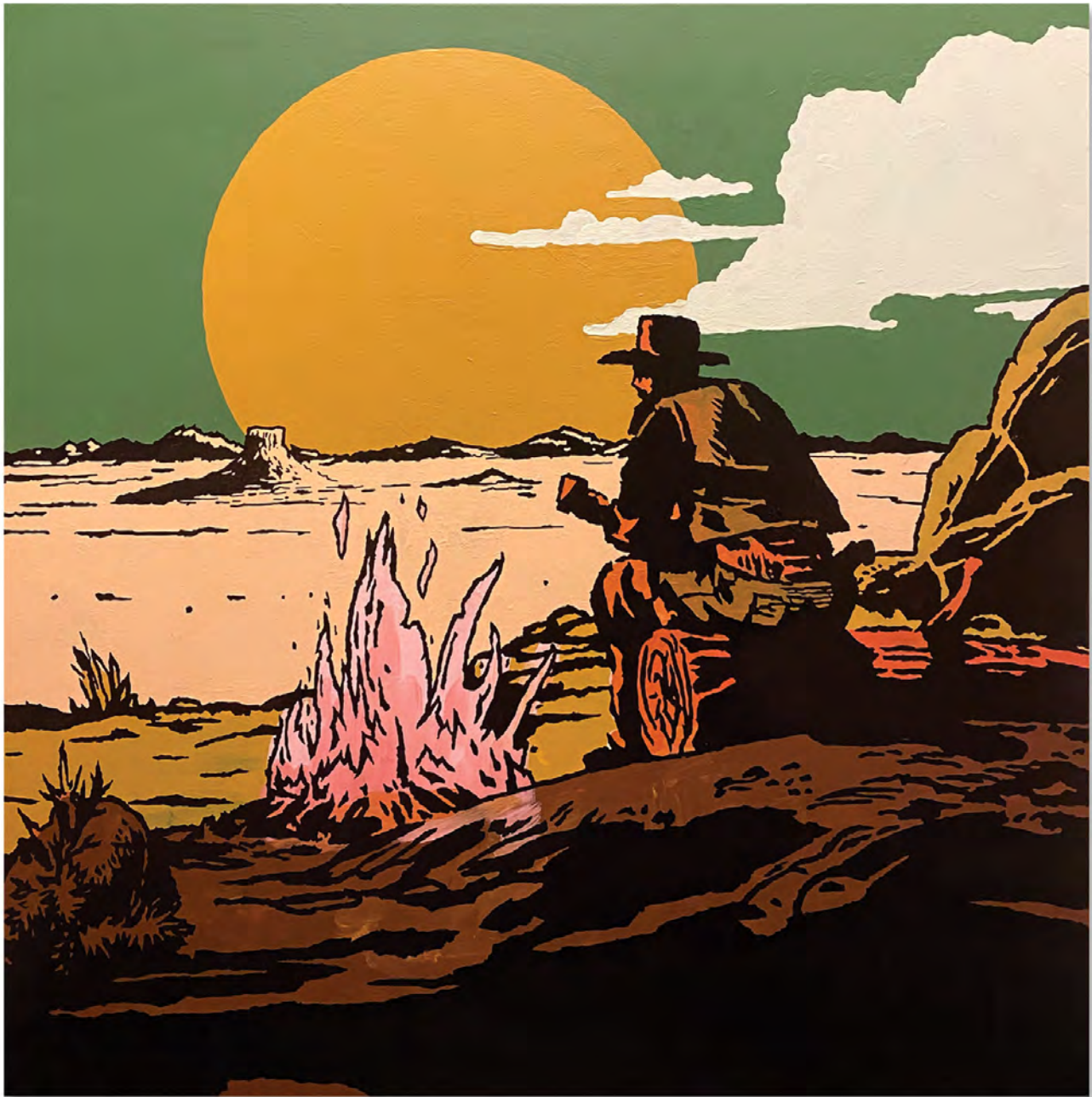
Cup Full of Comfort, 36" X 36", acrylic/oil

In the late 1800s, the western art genre morphed from artists like Charlie Russell, who captured scenes he witnessed or his cowboy friends told him about, to more fictional tales in what would become known as dime-store western novels.