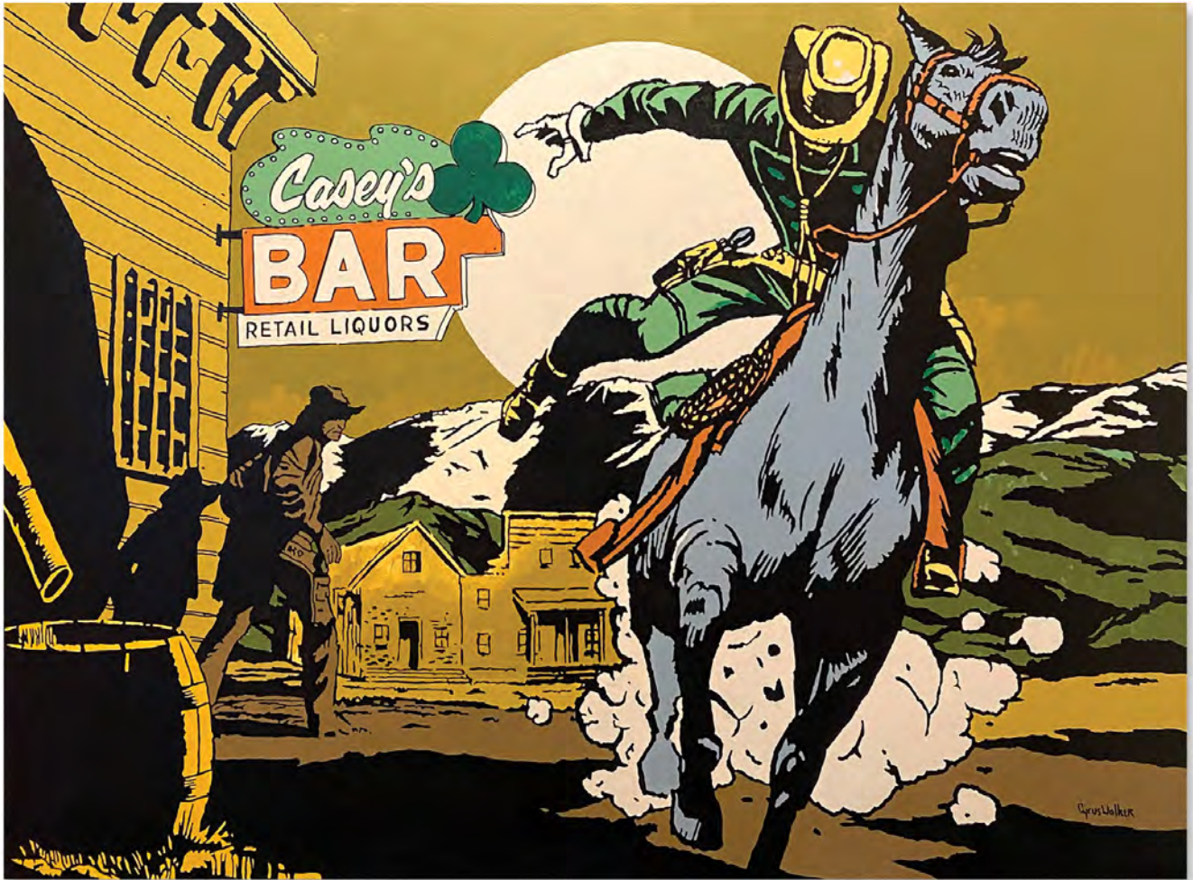
Beer Run, 36" x 48", acrylic/oil