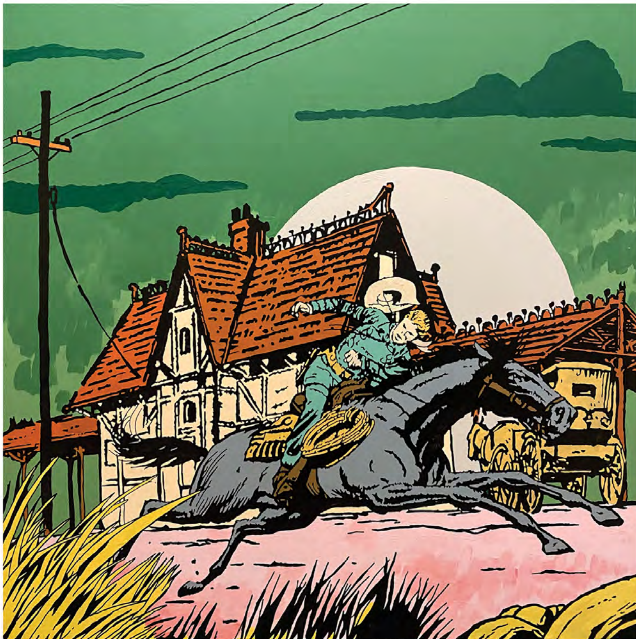
Telegram, 36" x 36", acrylic/oil