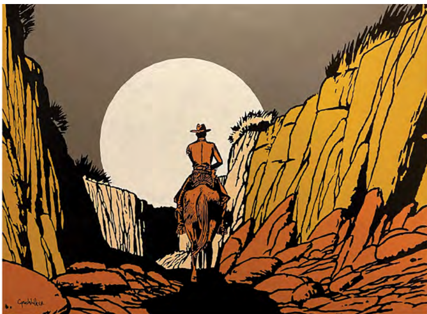
"Arroyo Passage" 36" X 48", acrylic/oil

time fan and collector of old western novels and comic books, he took the plunge seven years ago and hasn't looked back.