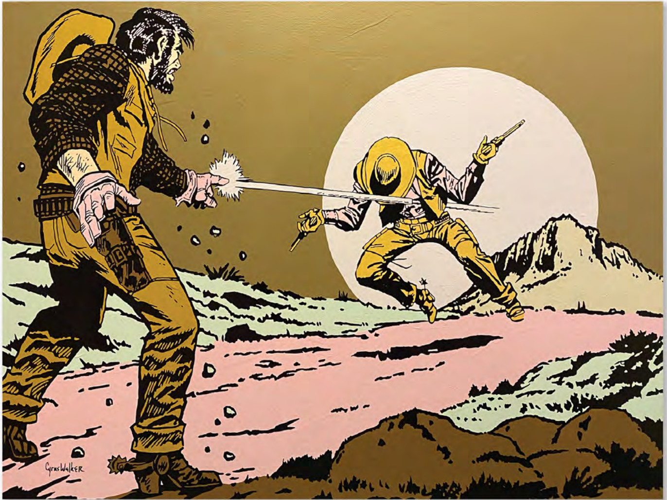
Beam Cannon, 36" x 48", acrylic/oil