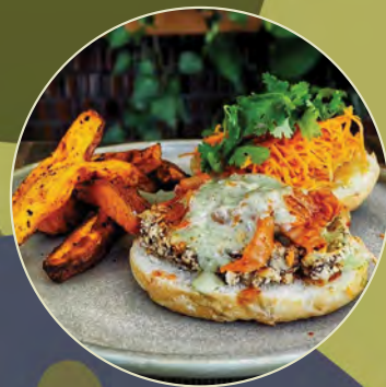
LEFT: THE COUP

Here in Calgary, we pride ourselves on being one of the greenest cities in the country, and there are lots of ways to participate in this lifestyle during your summer vacation. Whether you're interested in food, shopping, or simply spending time outside, we have you covered on all the city's greatest eco-friendly experiences to try out this summer.